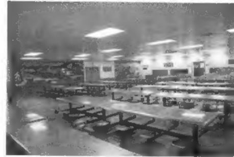
Pitchess Detention center South Facility, Los Angeles California